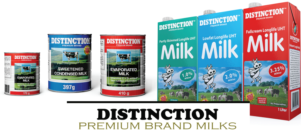
DISTINCTION PREMIUM BRAND MILKS